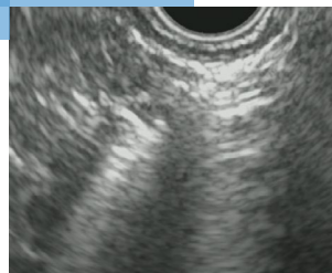
Pancreatic radiofrequency ablation